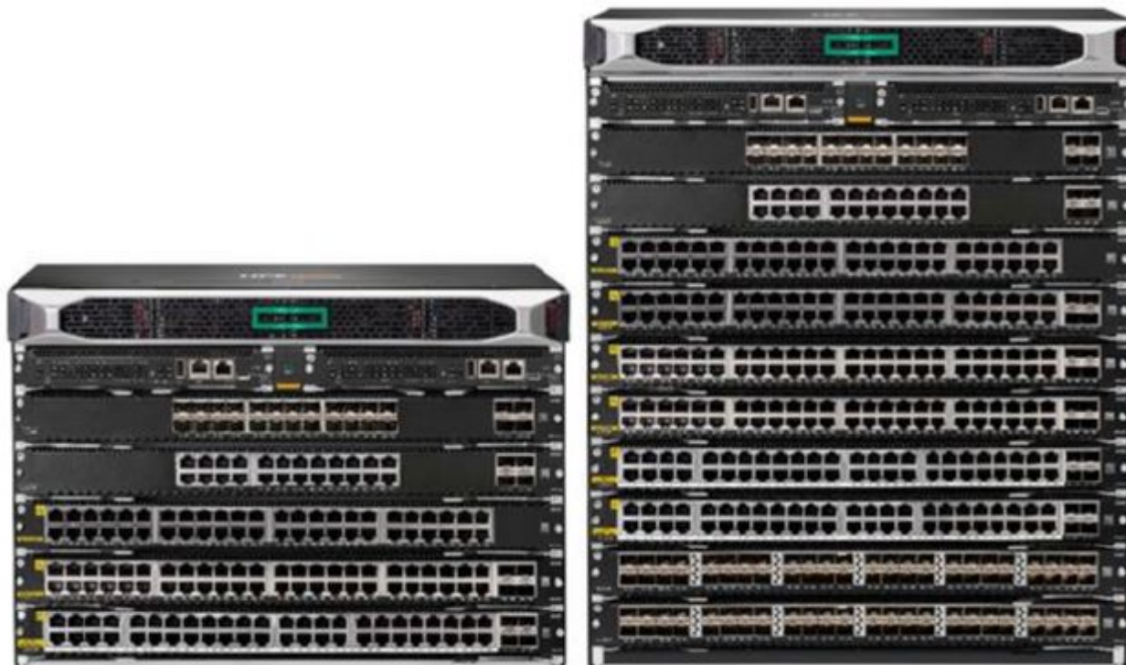
HPE Aruba Networking CX 6400 Switch Series

Dynamic segmentation extends foundational wireless role-based policy capability to wired switches. What this means is that the same security, user experience and simplified IT management can be enjoyed throughout the network. Regardless of how users and IoT devices connect, consistent policies are enforced across wired and wireless networks, keeping traffic secure and separate.